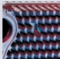
Special gray cast iron heat exchanger surface

Impressive performance in an economical and compact design. The Vitogas 050, EC Series feature space-saving construction, allowing for closet installation with minimal clearances.