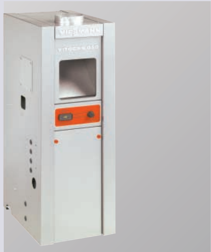
Vitogas 050, ECD – for chimney venting