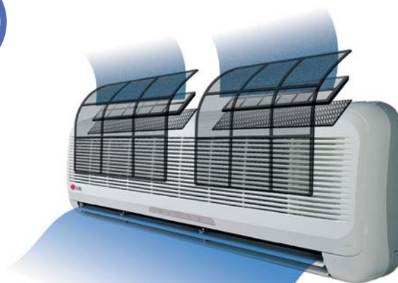
TRIPLE FILTER AIR PURIFYING SYSTEM